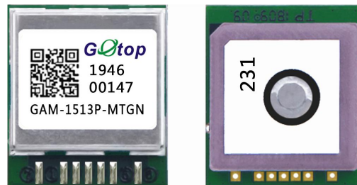
Figure1: GAM-1513P-MTGN Top View